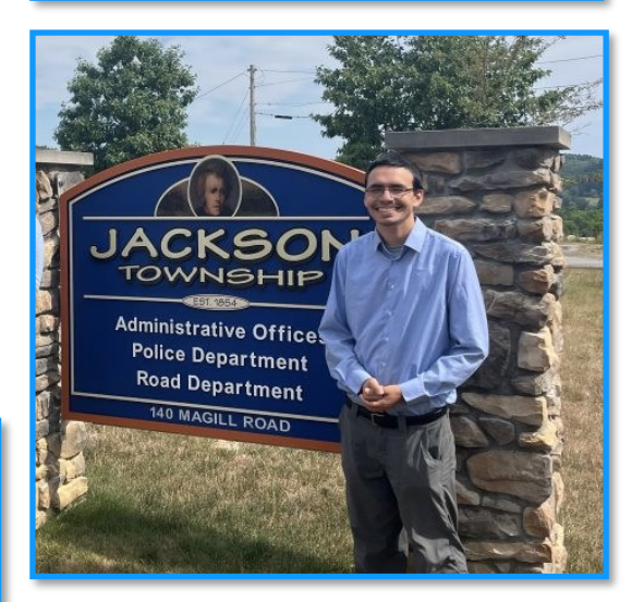
This is me standing by the Jackson Township Administrative Offices Entrance