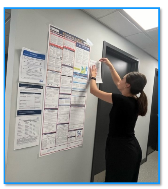
Here I am updating the Labor Law poster and compliance information for our Public Works crew, which is a key component of the compliance responsibilities in Human Resources.