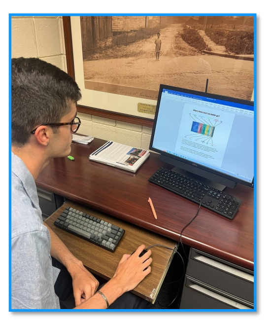
This is me creating a graphic to help resident understand where the Borough allocates funds. It's a quick way for residents to see exactly where their taxes go.