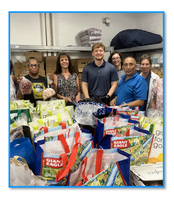
Group photo of myself and other volunteers helping pack food bags for the Leetsdale Food Pantry.