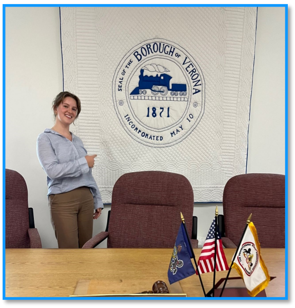
This is me in the City Council's Chamber with a quilted Borough of Verona seal!