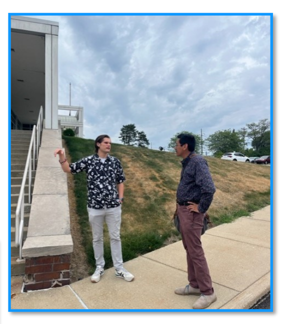
Discussing strategic planning and stakeholder engagement to shape Monroeville's future initiatives.