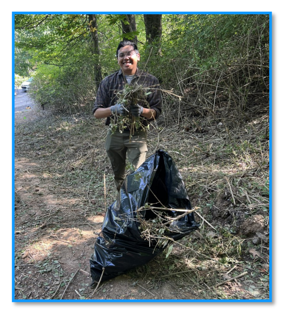
Normally I visit a site and interview the intern, at Kilbuck I was a community clean up volunteer!