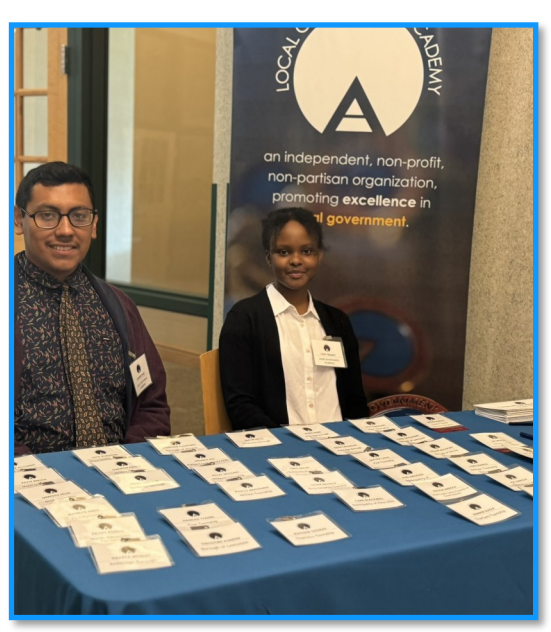
This is me helping to organize the interns' development day by helping with registration and other set up needs.