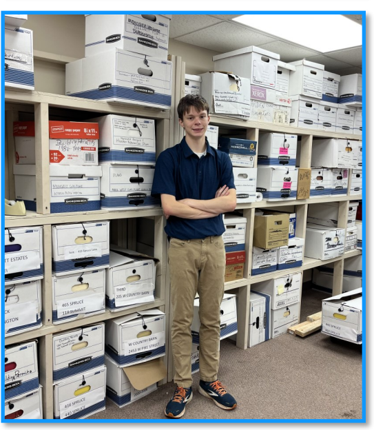
This is me gathering building permits from our records room by taking them out of the boxes and entering it into our GIS system.