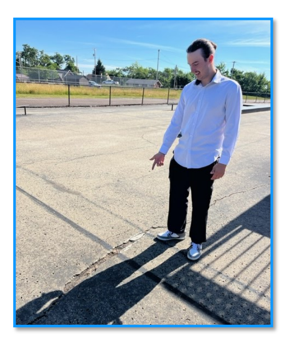
A lot of my worked involved ensuring that parks meet a minimum level of safety!