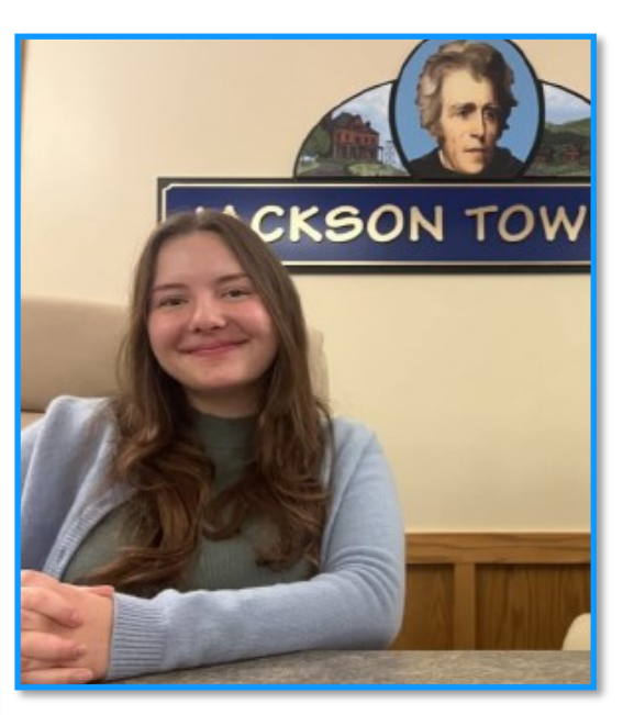
Me, pictured at the Jackson Township office.