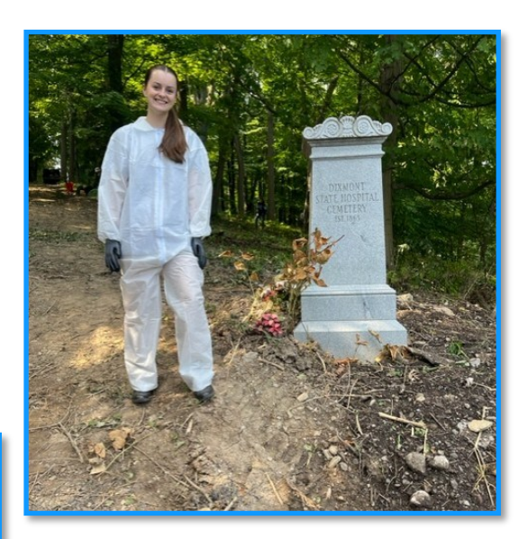
This is me at the Dixmont State Hospital Cemetery after I coordinated a successful community clean-up day!